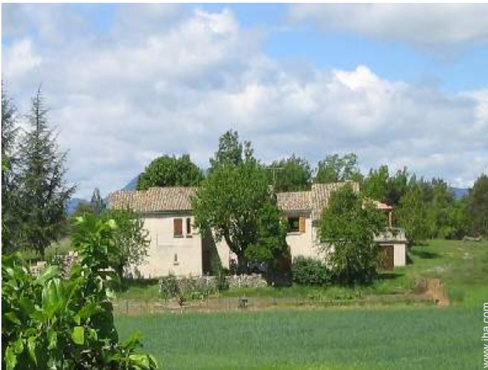
Charming Provencal House