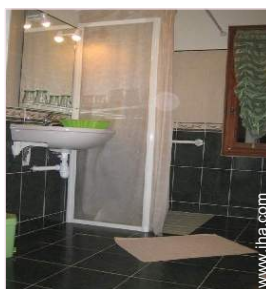
fitted out for the disabled