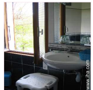
fitted out for the disabled