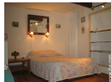
sleeper sofa(s) 2 pers

Terrace 215 Sq.ft., covered terrace 323 Sq.ft., yard table(s), 6 yard seat(s), arbour, parasol, 4 sun recliner(s), sun lounge