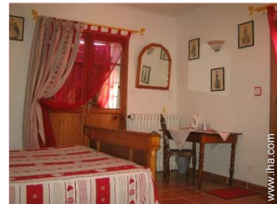
Interior layout at guests disposal