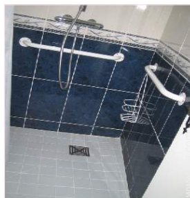
fitted out for the disabled