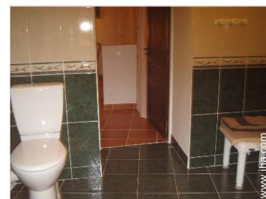
fitted out for the disabled