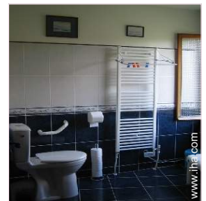
fitted out for the disabled

Terrace 215 Sq.ft., covered terrace 323 Sq.ft., yard table(s), 6 yard seat(s), arbour, parasol, 4 sun recliner(s), sun lounge