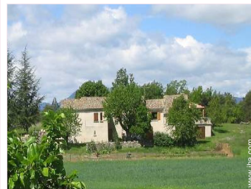
Charming Provencal House