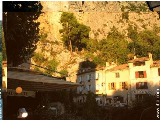
Cities close by