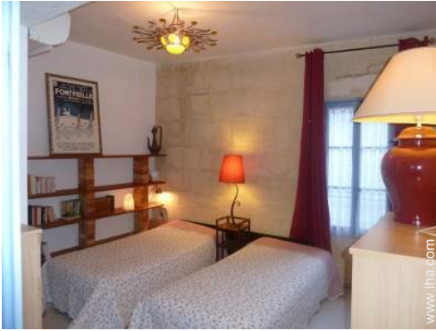
two twin beds