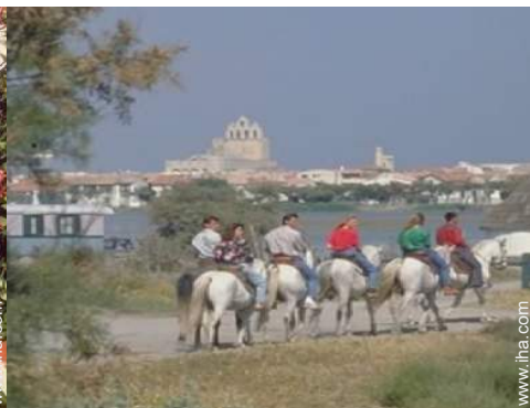
summer sports nearby