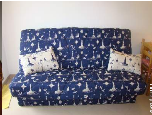
sleeper sofa(s) 2 pers