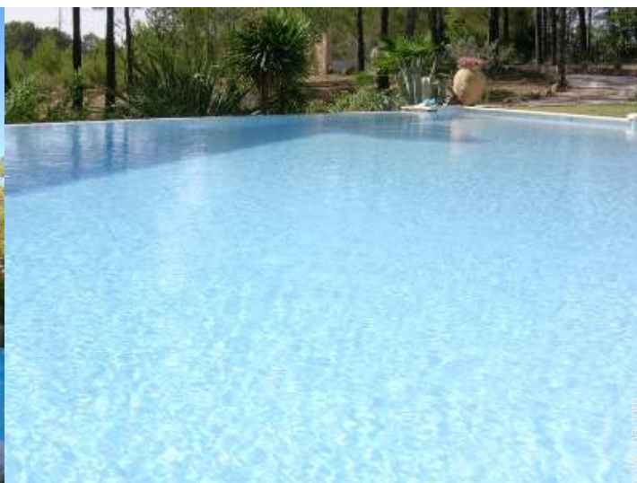
Cascading swimming pool