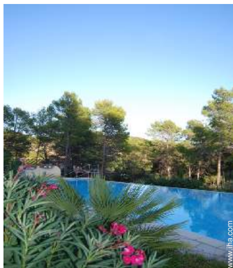
Cascading swimming pool