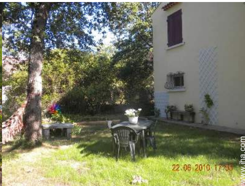
Exterior amenities at guests disposal