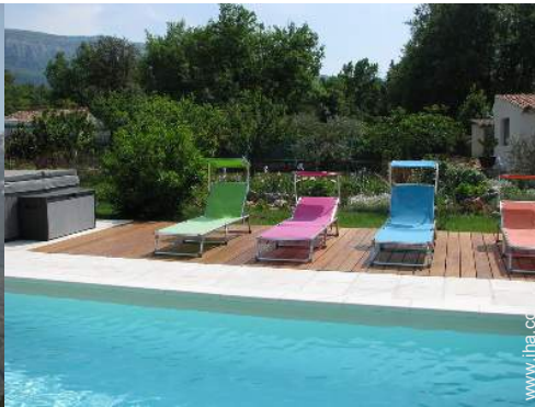
Exterior facilities at guests disposal