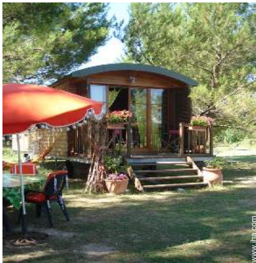
Charming Gypsy Caravan