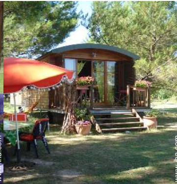
Charming Gypsy Caravan