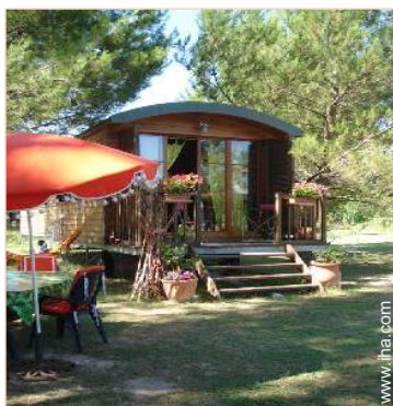
Charming Gypsy Caravan