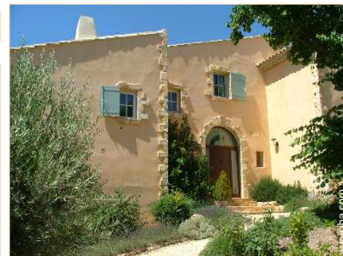
Luxury Provençal House