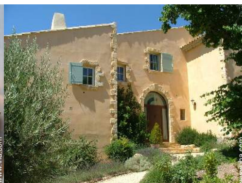
Luxury Provençal House