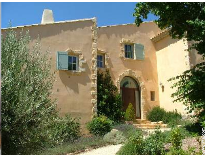
Luxury Provencal House