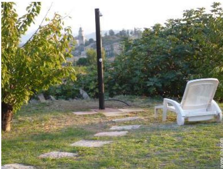
outside shower facilities