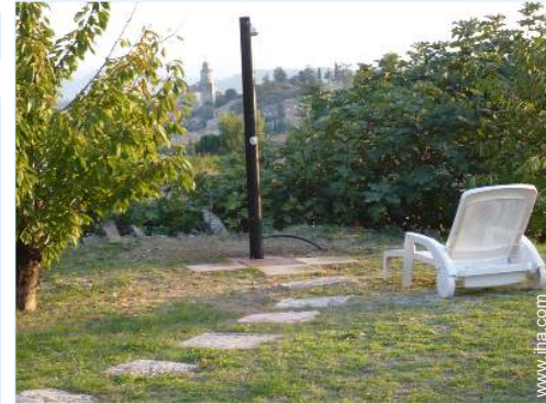
outside shower facilities