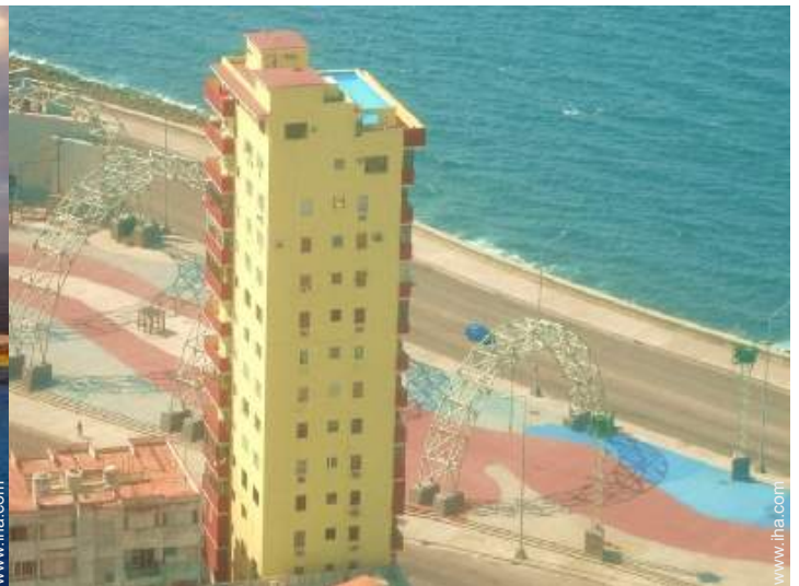
Mansion Town House