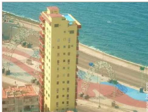
Mansion Town House