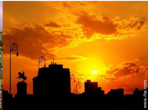
view of a monument