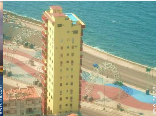
Mansion Town House