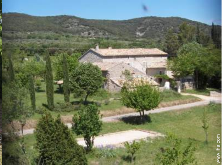
Charming Mas (Farm House)