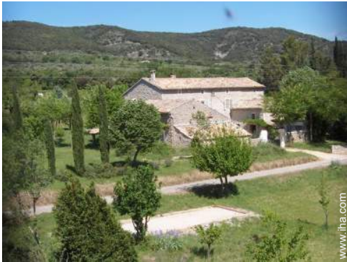
Charming Mas (Farm House)