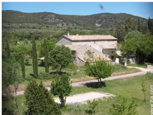
Charming Mas (Farm House)