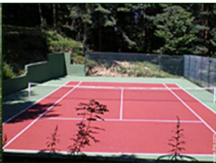
Facilities exclusive to