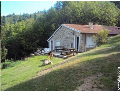
Outside at the guests disposal