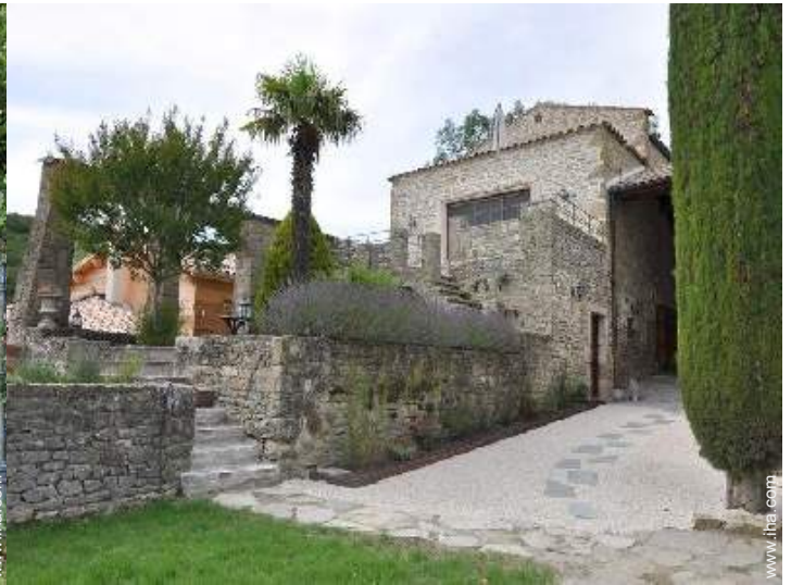
Luxury Provençal House