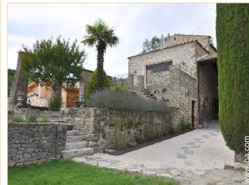
Luxury Provençal House