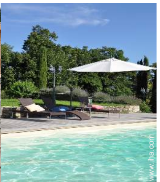
heated swimming pool