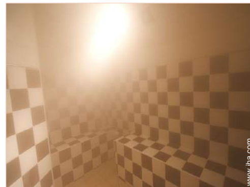
Facilities exclusive to

Gaz BBQ, yard table(s), 10 yard seat(s), parasol