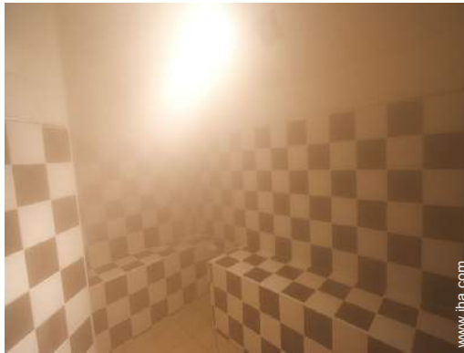
Facilities exclusive to