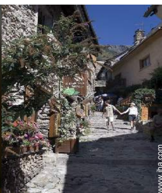
view over a pedestrianized street