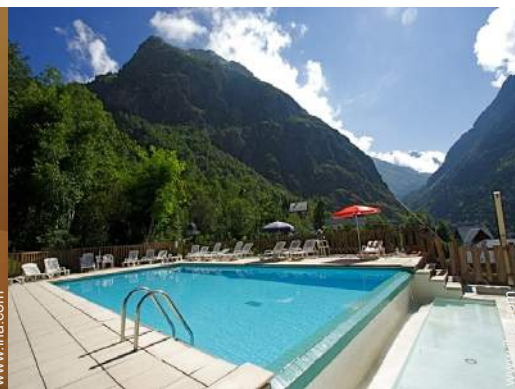
heated swimming pool