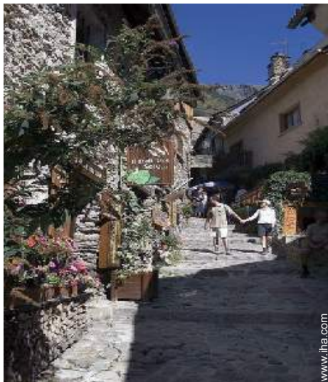
view over a pedestrianized street