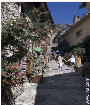
view over a pedestrianized street