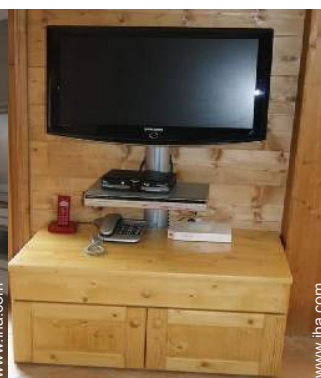
wifi (wireless internet access)