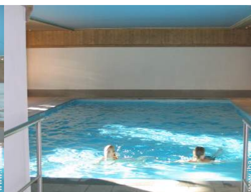
Covered swimming pool