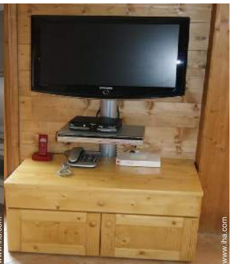
wifi (wireless internet access)