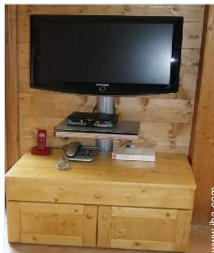
wifi (wireless internet access)