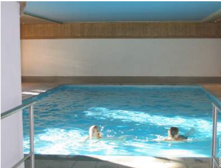
Covered swimming pool