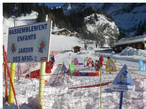
kids ski area