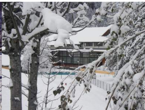
public swimming pool