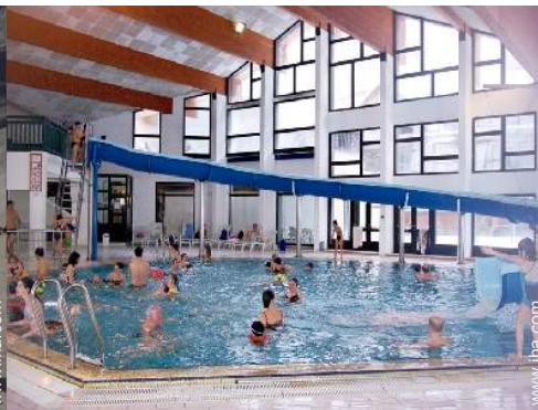
public swimming pool