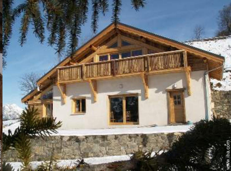
Charming Mountain Chalet