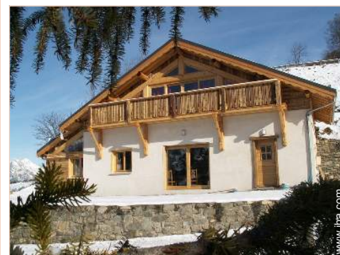
Charming Mountain Chalet