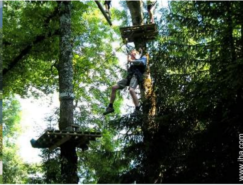
summer sports nearby