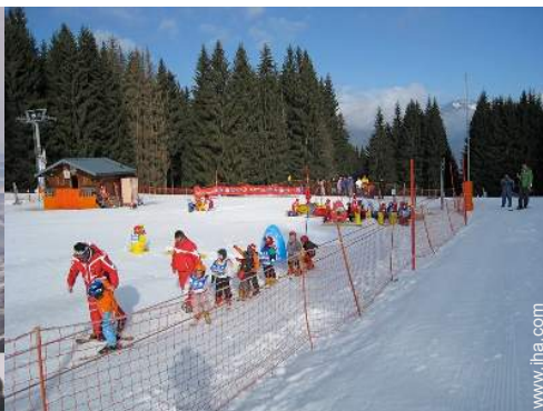
kids ski area