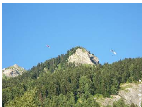
flying pursuits nearby