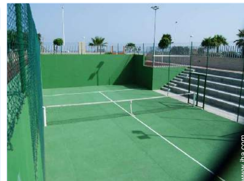
Tennis - hard surface