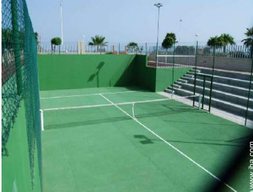
Tennis - hard surface