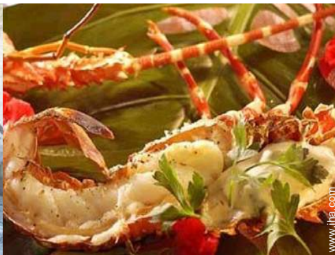
locally produced meals