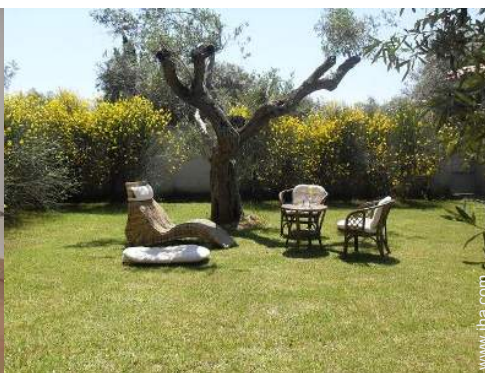
view over prairie