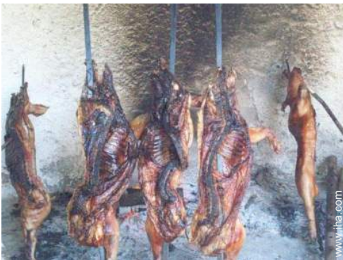
locally produced meals