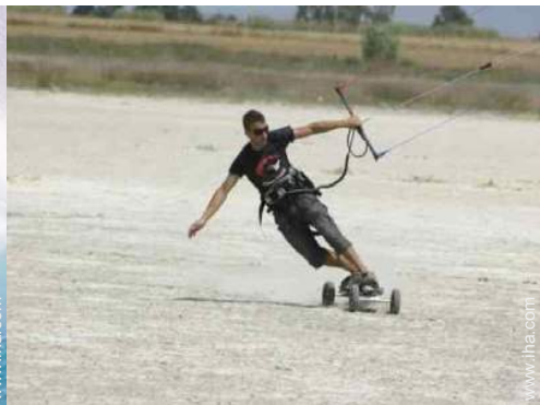
flying pursuits nearby