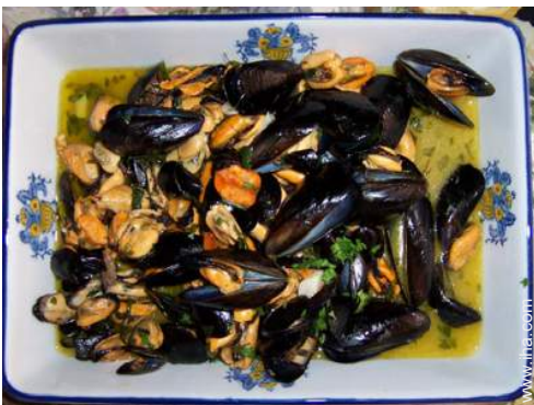
locally produced meals