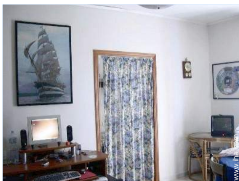
high speed internet access