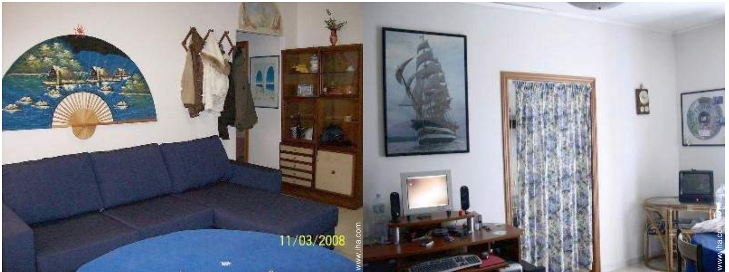
sleeper sofa(s) 2 pers