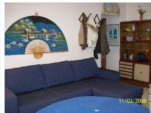
sleeper sofa(s) 2 pers