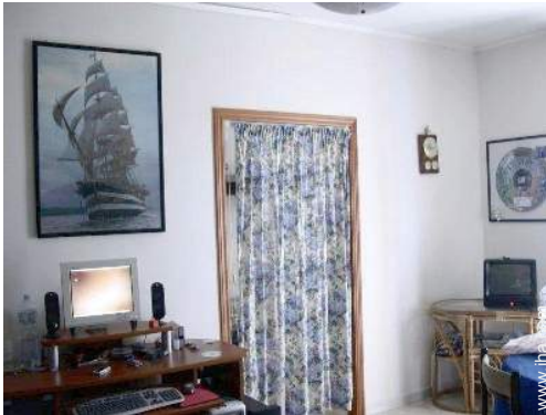
high speed internet access