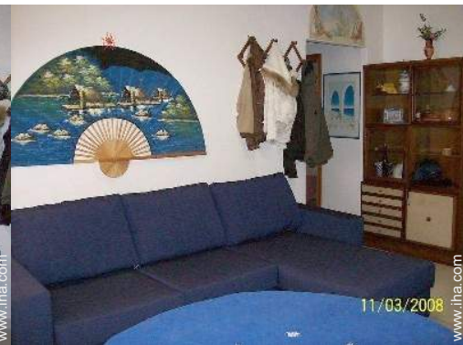
sleepers sofa(s) 2 pers