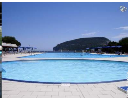
Sea water swimming pool