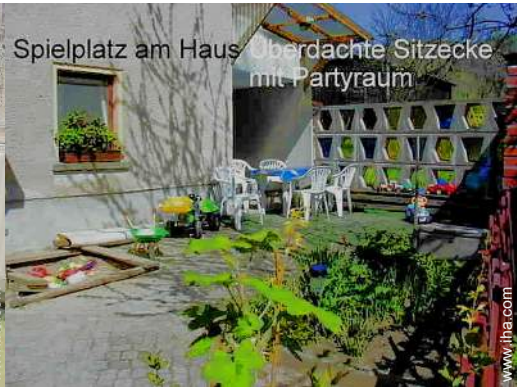
Spielplatz am Haus Überdachte Sitzzecke mit Partyraum