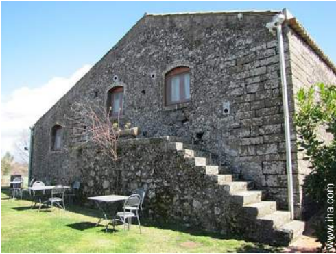
Exterior facilities at guests disposal