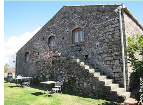
Exterior facilities at guests disposal