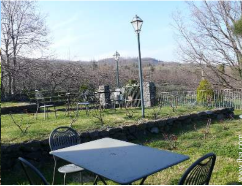
Exterior facilities at guests disposal