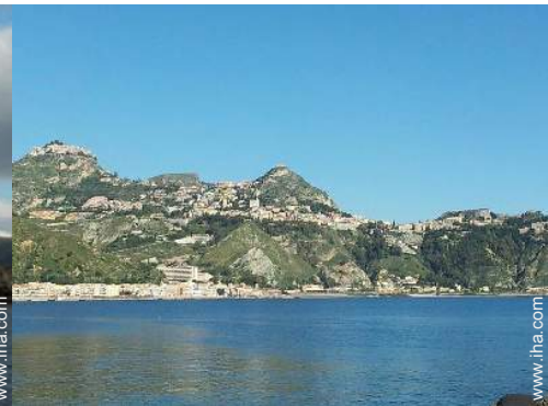
Cities close by