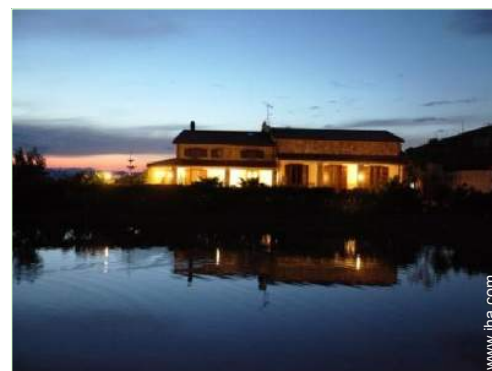
view over the lake