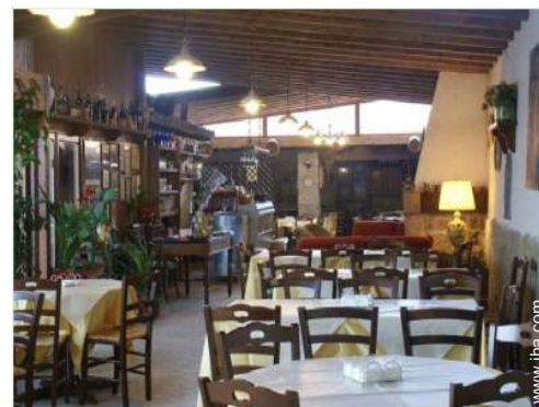
Interior layout at guests disposal