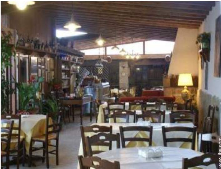
Interior layout at guests disposal