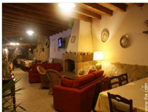
Interior comforts at guests disposal