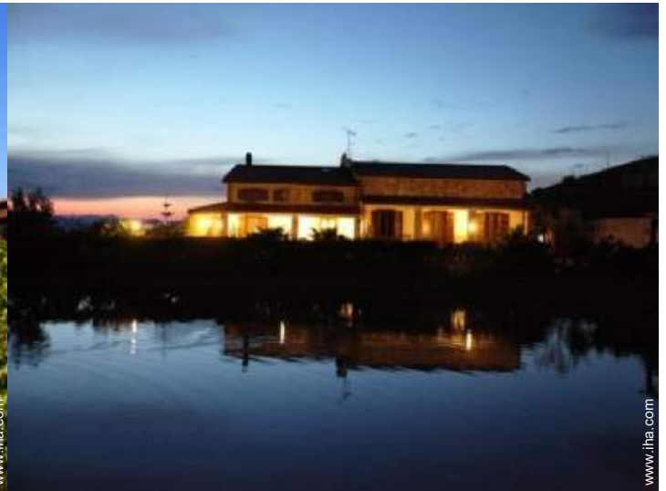
view over the lake