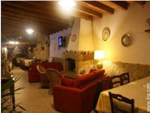
Interior comforts at guests disposal