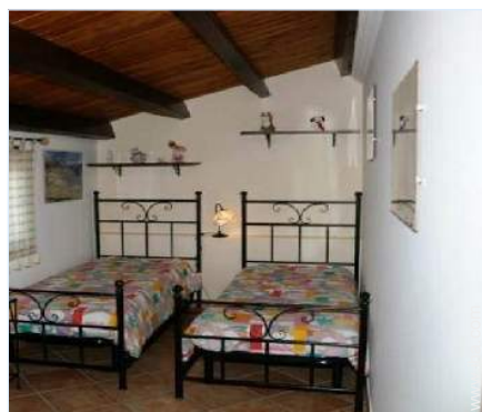
two twin beds