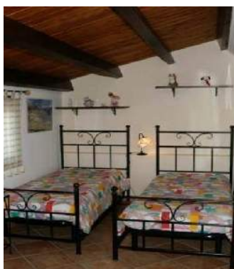
two twin beds