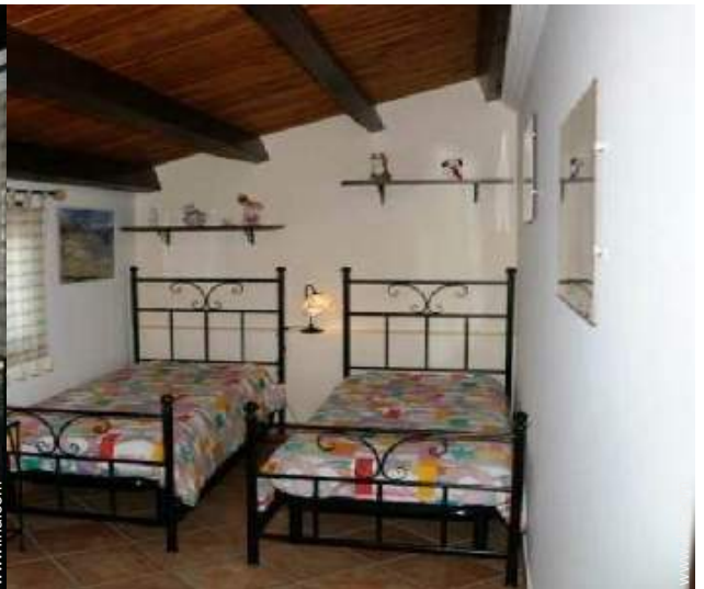
two twin beds