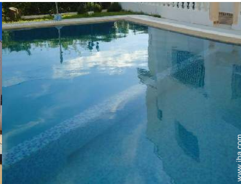
Cascading swimming pool