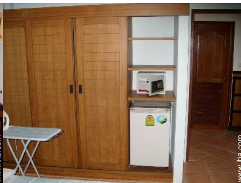
safe deposit box