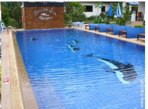
Cascading swimming pool