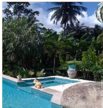
view over the forest