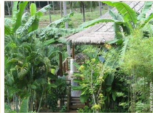
Outside at the guests disposal