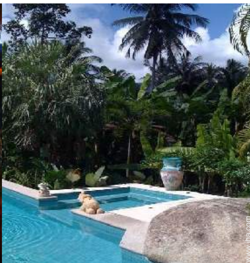
view over the forest