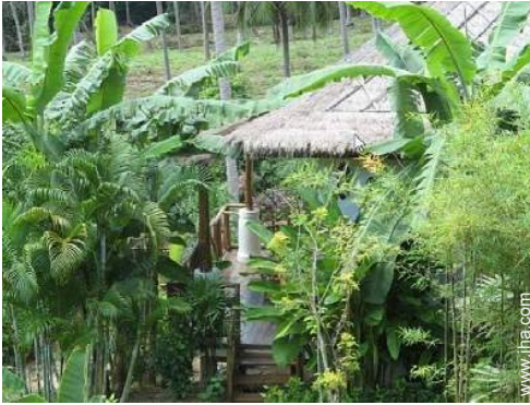
Outside at the guests disposal