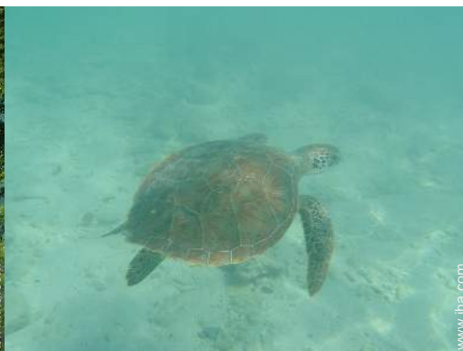
Present on site