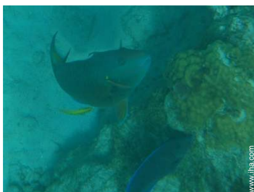
Present on site