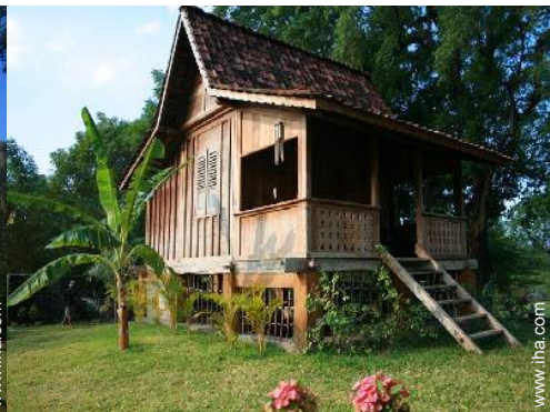
possible additional sleeping supplementary