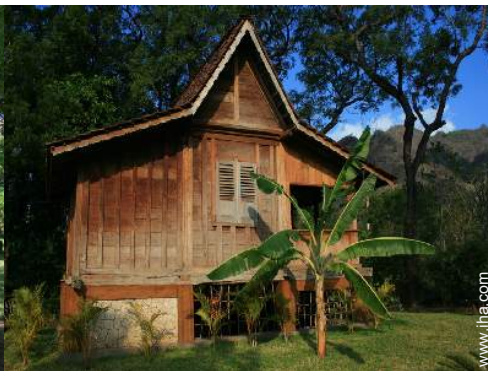
possible additional sleeping supplementary