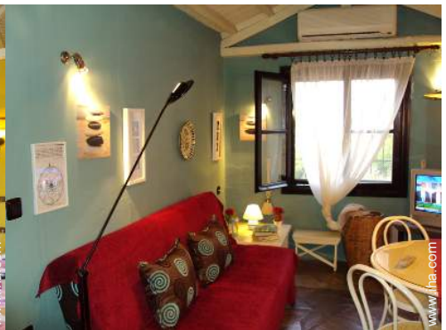
sleepers sofa(s) 1 pers