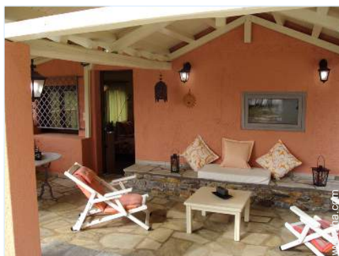
summer living area