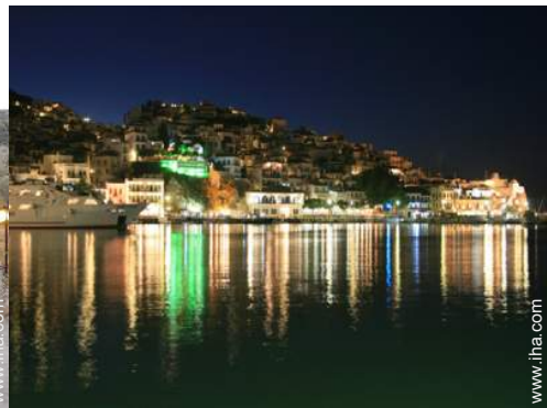
Cities close by