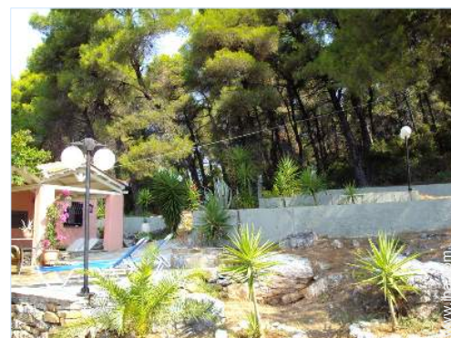
view over the forest