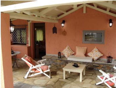
summer living area