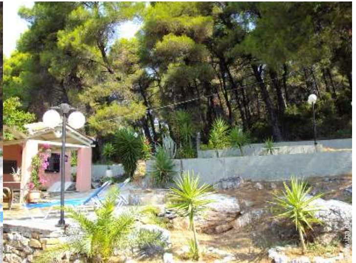
view over the forest