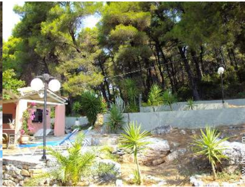
view over the forest