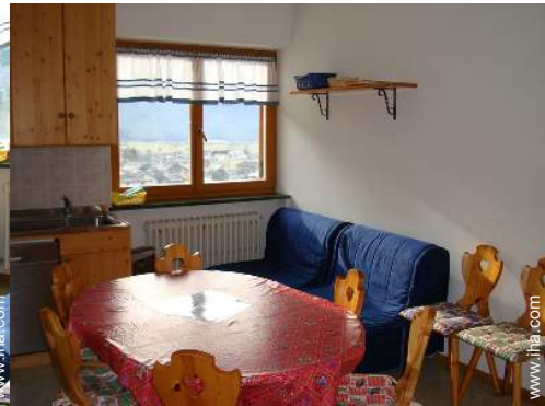
sleeper sofa(s) 1 pers