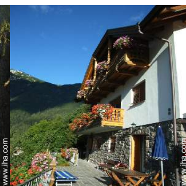
Exterior amenities at guests disposal