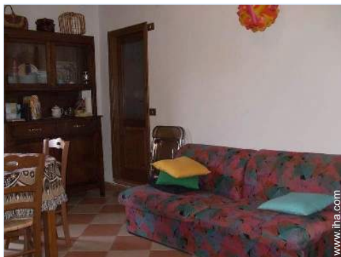
sleeper sofa(s) 2 pers