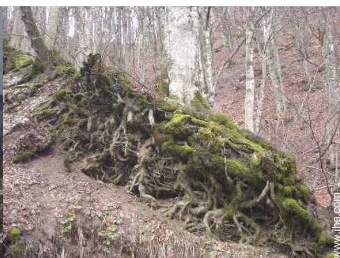
view over the forest