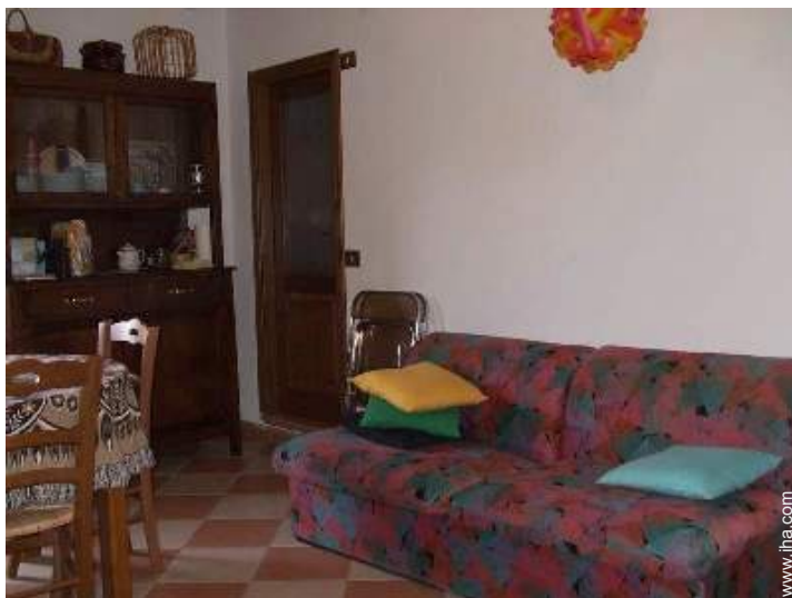
sleeper sofa(s) 2 pers