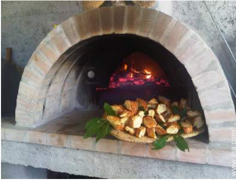
locally produced meals