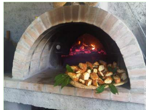
locally produced meals