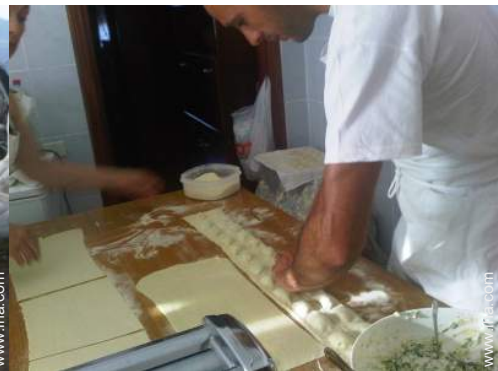
locally produced meals