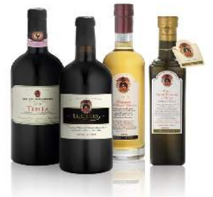
cellar and wine tasting