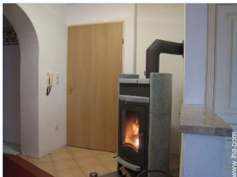
solid fuel burning stoves