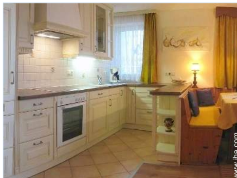
large american style kitchen