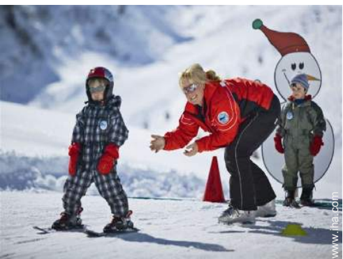
kids ski area