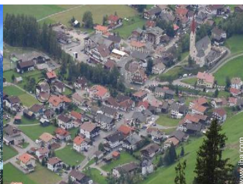
view of the village center