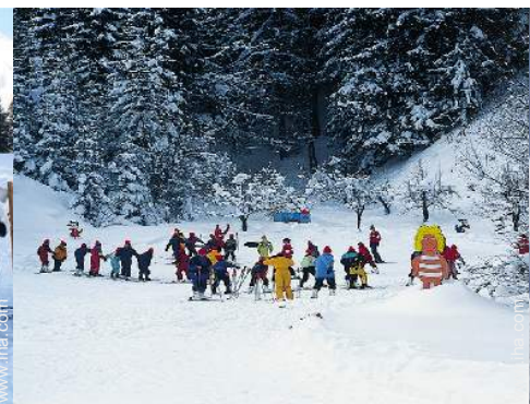
kids ski area