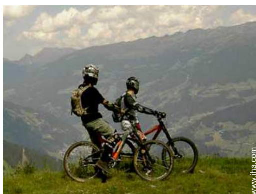
mountain bike (path)