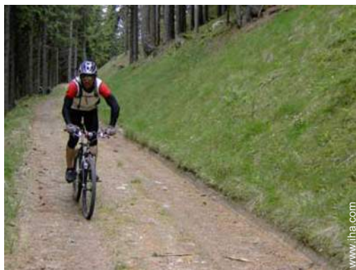
mountain bike (path)