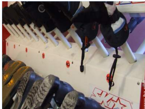
ski boot warmer