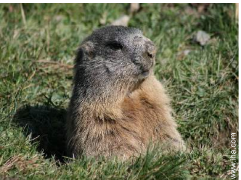
mountain pursuits nearby