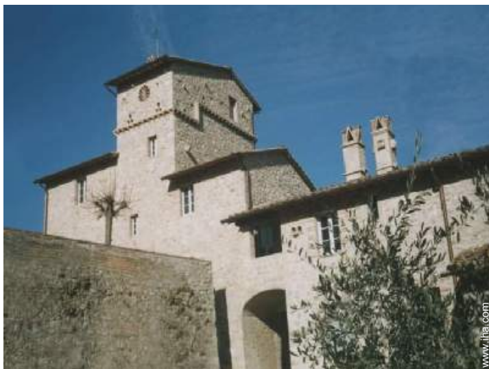
Charming Mas (Farm House)