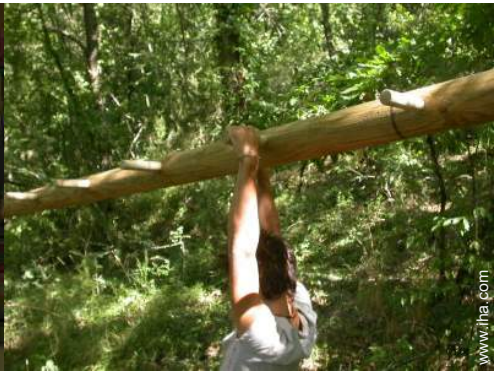
summer sports nearby