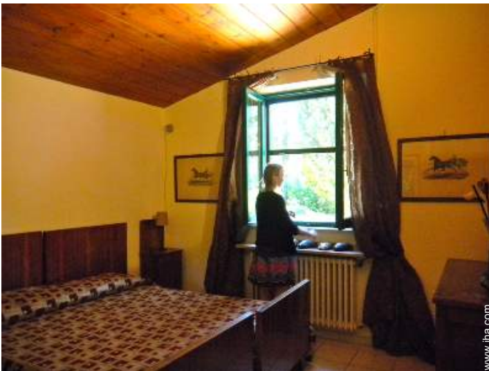
two twin beds