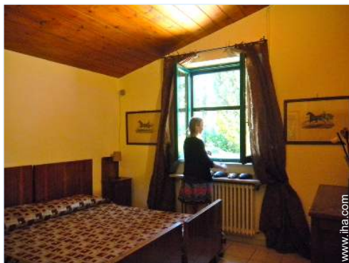
two twin beds