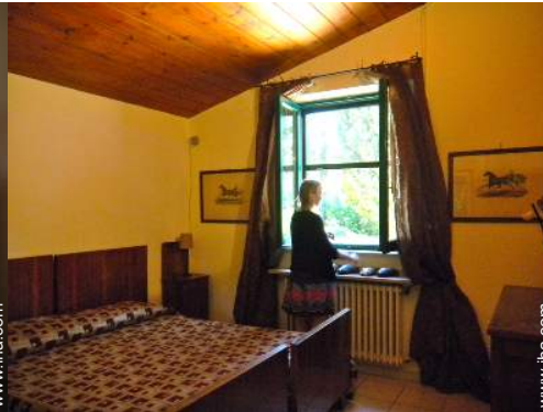
two twin beds