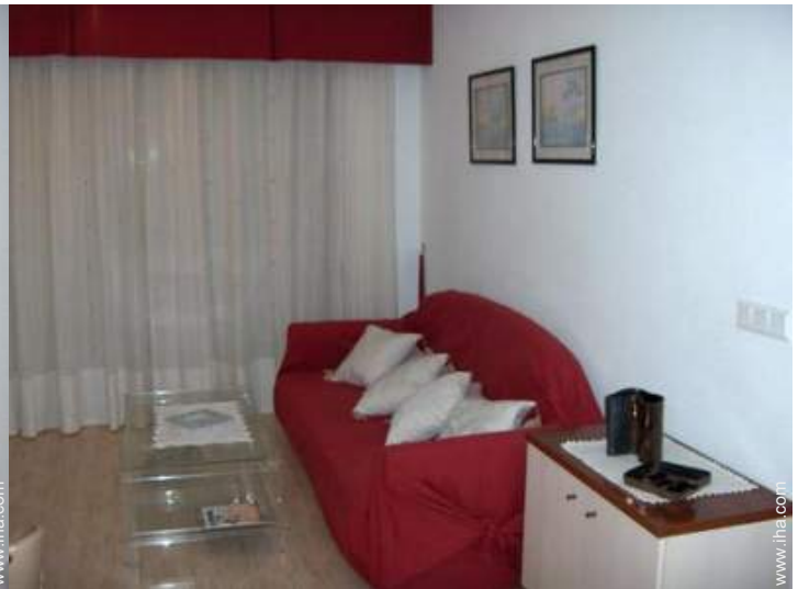
sleepers sofa(s) 2 pers