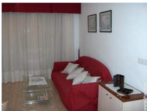
sleeper sofa(s) 2 pers