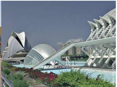
Cities close by