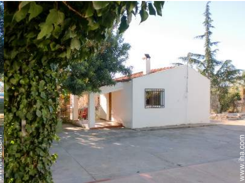
Facilities exclusive to