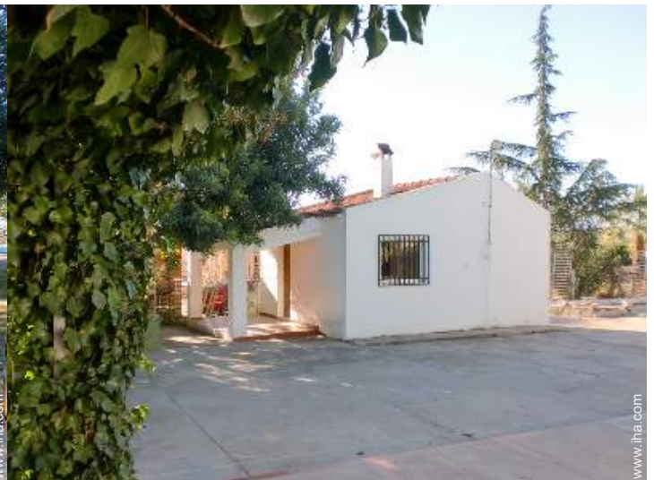
Facilities exclusive to