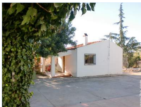
Facilities exclusive to