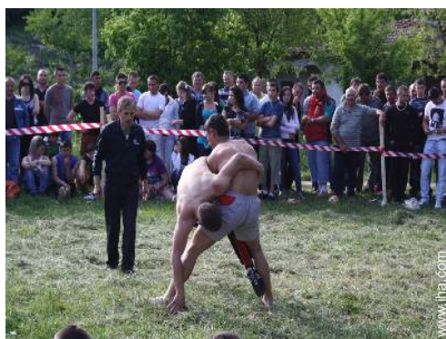
summer sports nearby