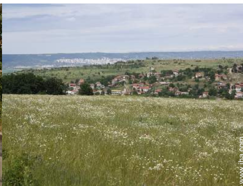
view over farmland