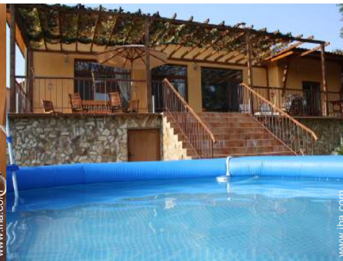
Round swimming pool