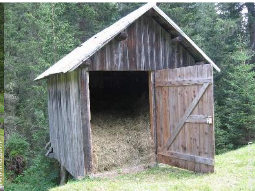
mountain pursuits nearby