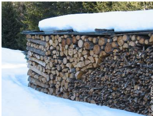
view over the forest