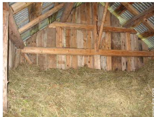
mountain pursuits nearby