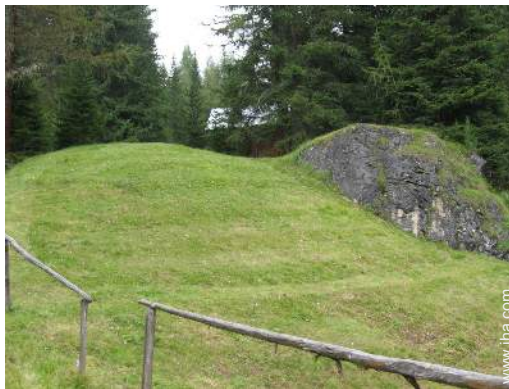
mountain pursuits nearby