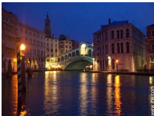
Cities close by