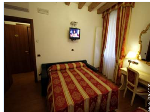
sleeper sofa(s) 2 pers