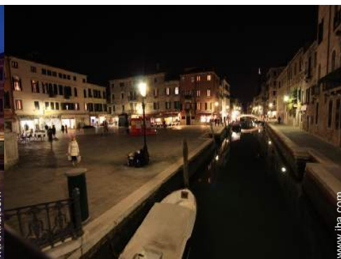
Cities close by