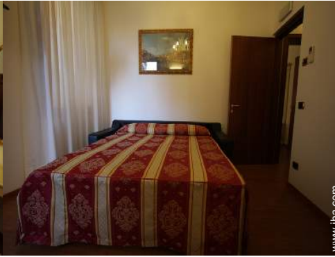
sleeper sofa(s) 2 pers