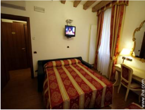
sleeper sofa(s) 2 pers