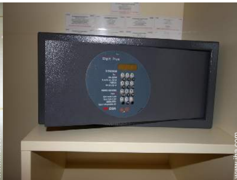
safe deposit box