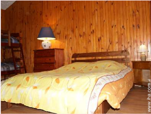
The chambre d'hôtes/B&#38;B