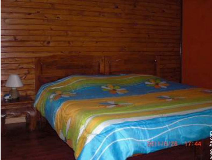
The chambre d'hôtes/B&#38;B