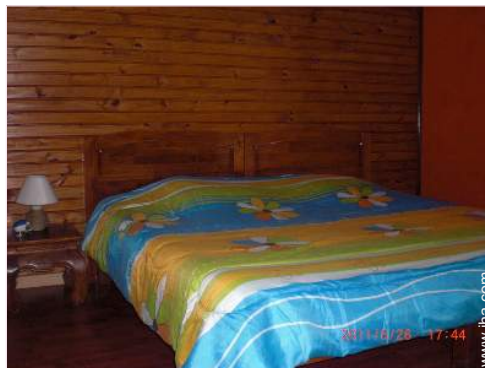
The chambre d'hôtes/B&#38;B