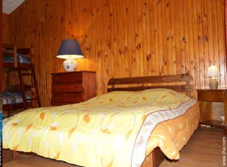
The chambre d'hôtes/B&#38;B