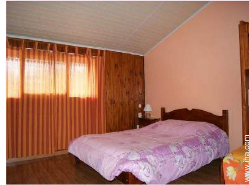
The chambre d'hôtes/B&#38;B